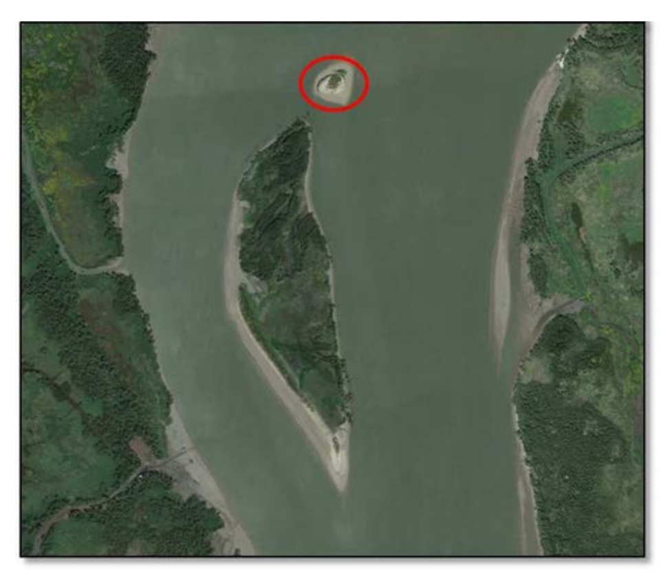
Figure 1 : Horseshoe Bend Island, a 35 ha island supported by strategic dredge material placement. Note the small dredged material mound (circled) placed immediately upriver (north) of the island. Image dated October 28, 2012.

Award Category: Mitigation or Adaptation to Climate Change