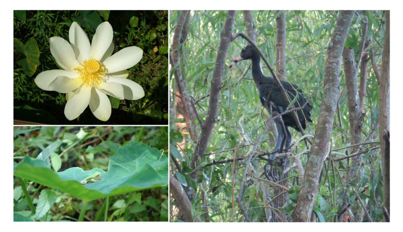
Figure 2 . A diverse assemblage of native plant and animal life has colonized the island, including the native American lotus ( Nelumbo lutea ; upper left), various amphibians (lower left), and juvenile glossy ibis ( Plegadis falcinellus ; right) observed during nesting season.

The improvement of the environment, specifically the new populations of flora and fauna, is a key service created on the island. The island provides approximately 6.0 ha of new emergent habitat, and 7.7 ha of aquatic bed habitat. The island supports 81 plant species and 23 animal species, including 9 species of wading birds (Figure 2). It supports both a healthy (i.e., not Chironomid-dominated) invertebrate community and a microbial community that promotes nutrient sequestration in the soil.